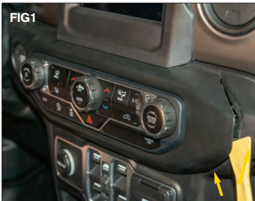
Put on safety glasses. Using a trim clip removal tool gently remove the center dash control center (FIG 1)