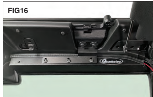
passenger side light bar up and over the rear view mirror, careful not to knock off the smaller end gasket and loosely attach the light bar to the bracket using the supplied T-40 torx bolts. (FIG 16)