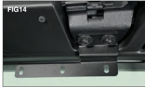
Remove the hardware using a T-40 Torx socket and loosely install the supplied brackets as shown. (FIG 14)