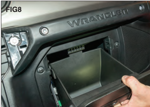
Push up on the glove box stop, tilt glovebox down, remove it and set aside. (FIG8) Now, route the new harness through the dash and out behind the