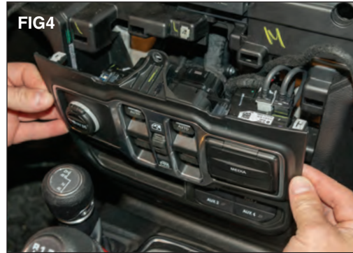
Gently pry out the window control panel from the top and work your way down. (FIG 4)