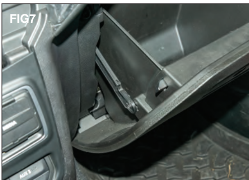
Open the glove box and disconnect the strut on the side by sliding it towards the top of the glove box. (FIG 7)