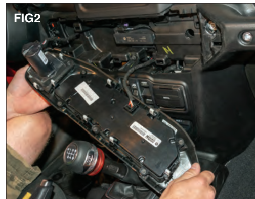
Disconnect any wiring harnesses and set control panel aside. (FIG 2)