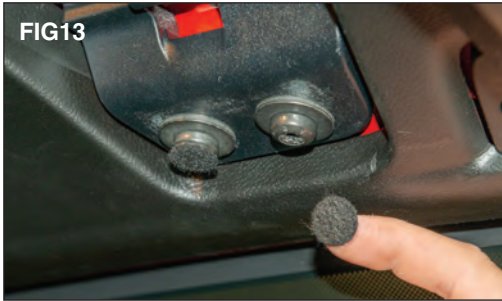
Unlatch and open the soft top or remove hard top front panels. Remove the felt padding on top of the brackets hardware. (FIG 13)