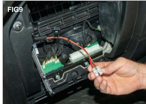
glove box. (FIG 9) You may now replace all of the center dash parts in the reverse order of removal. Do not re-install the glove box yet.