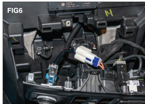
Connect the white connector to the original plug you just disconnected in FIG5. Connect the gray connector back into the 12v socket. (FIG 6)