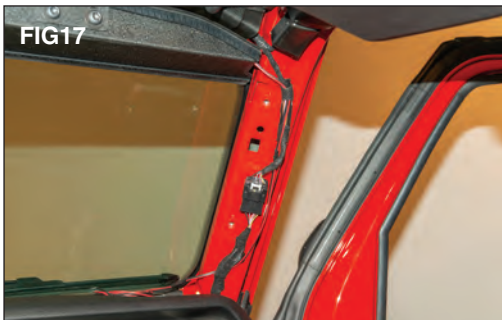
Now, route the wiring harness as shown down the A-pillar along side of the factory wiring. (FIG 17)