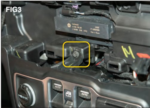
Remove the center screw using a Phillips head screwdriver and set aside. (FIG 3)