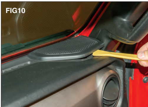
Using a trim tool gently pry up on the dash speaker cover and remove it. (FIG 10)