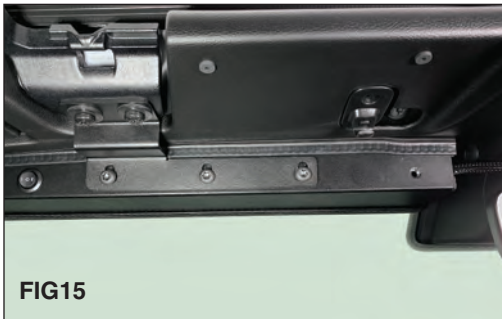
Tilt the driver side light bar into place, careful not to knock off the smaller end gasket. (FIG 15) Loosely attach the light bar to the bracket using the supplied T-40 torx bolts. Next, route the

NOTE THAT THE BRACKET IS NOT SYMMETRIC. THE SLOTS ON THE BRACKETS ARE 2 DIFFERENT SIZES. THE LARGER HOLES MUST BE USED ON THE TOP.