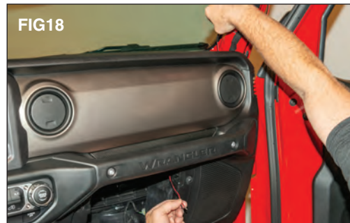
Fish the harness down through the dash to behind the glove box. (FIG 18)