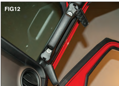
Remove the two bolts using a 10mm socket. (FIG 12) Remove handle and set it aside.