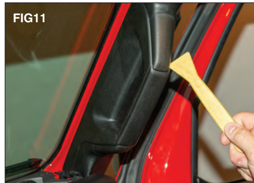
Using a trim tool gently remove the A-pillar grab handle covers. (FIG 11)