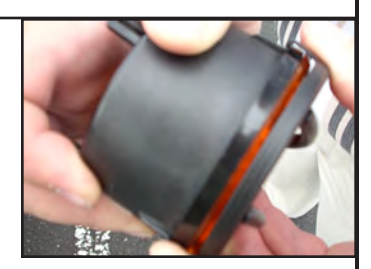
Step 6. With the guard seated onto the housing, squeeze the guard tabs tightly for a snug fit.