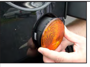
Step 3. The housing may now be removed from the front of the vehicle.

Step 4. Align the 3 metal tabs with the 3 housing tabs (they are spaced uniquely and