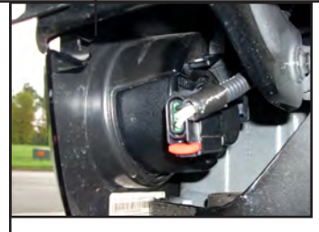
Step 8. Reinstall the bulb/socket assembly, remembering to rotate it to secure it to the housing.