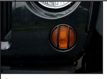
Step 9. Installation is now complete!