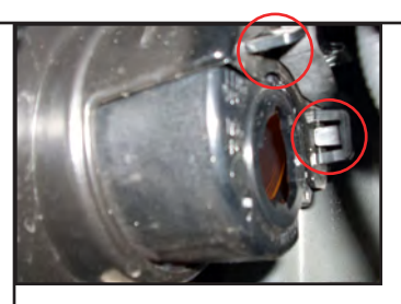
Step 2. With the bulb removed, locate the two housing retaining tabs (circled) and pry them outwards, releasing the housing.