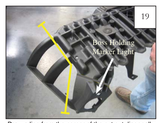
Draw a line from the corner of the cut out diagonally across the ribs of the factory inner structure as shown. Note: Line placement can vary 1/2" inch in either direction from shown. DO NOT CUT OFF BOSS HOLDING MARKER LIGHT.