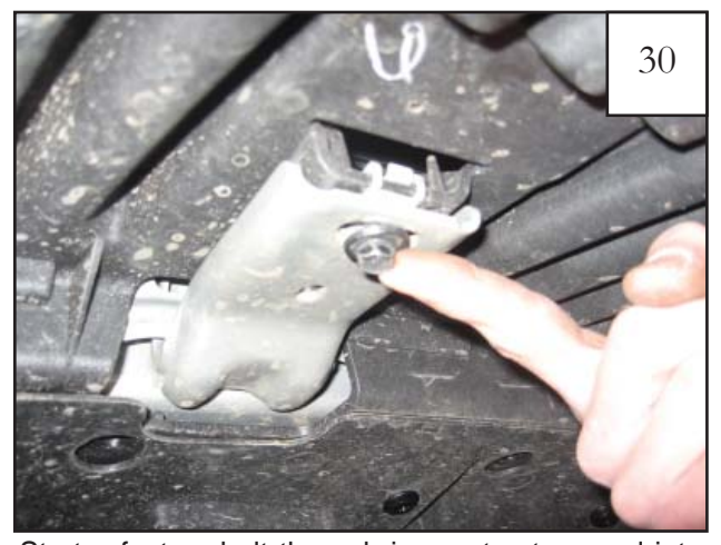
Start a factory bolt through inner structure and into brackets as shown. Note: It's easier to start bolts with your hands.