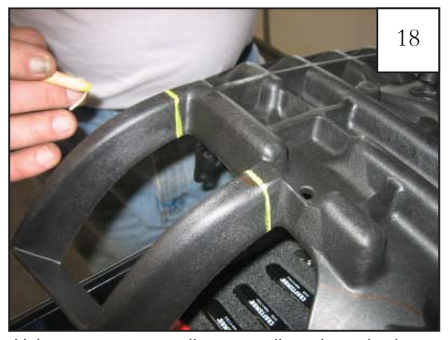
Using a grease pencil, trace a line along the base of the first and second spines of the factory inner structure as shown. This line will be cut in Step 20.