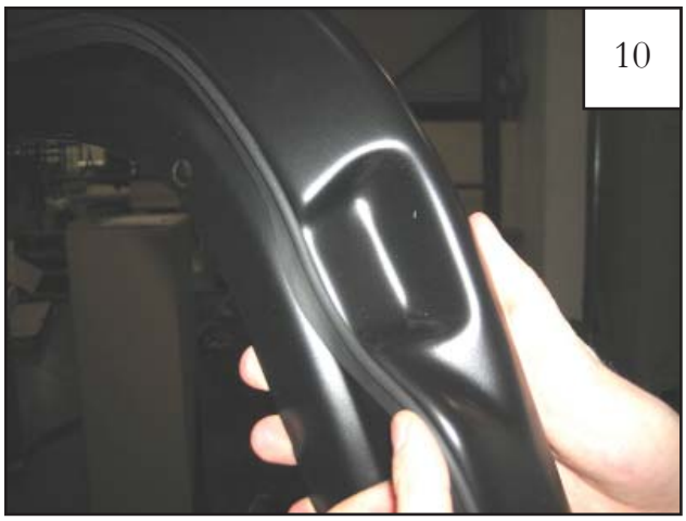
When positioning gimp around latch section for front, make sure round edge of gimp is positioned below the egde of the part (Gimp will continue over entire length of part).