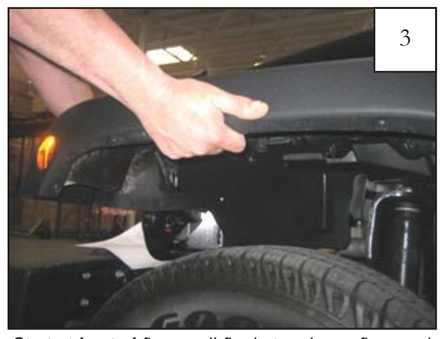
Start at front of flare, pull firmly to release flare and splash shield from fender, working your way to the back. You will hear popping noises as clips release. it is okay if the clips break, they will be discarded.