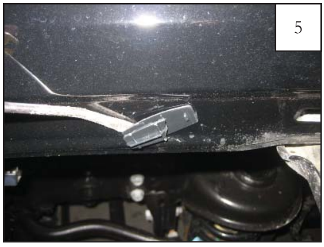
Using a pry tool or flat head screwdriver, remove any plastic clips that have remained in fender.