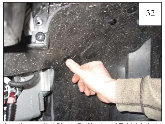
Install a supplied Plastic Phillips Head Tuf-lok in hole located towards the front of the splash sheild.