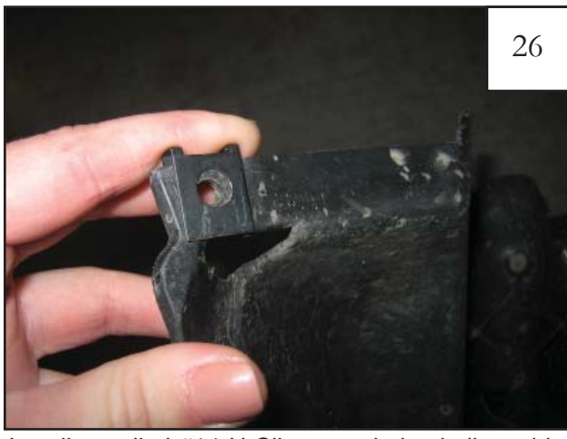
Install supplied #14 U-Clips over holes indicated in Step 27.