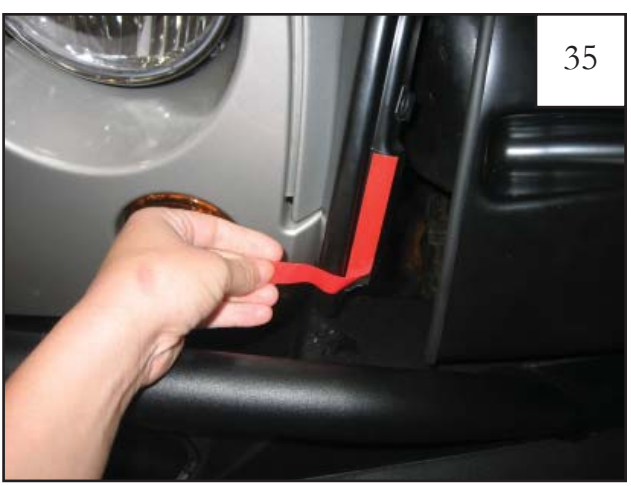
Fold tape liner tab attached to 1/2" peice of tape on outer edge of Inner Flare Piece upwards (do NOT peel liner from 1/2" tape in this step).