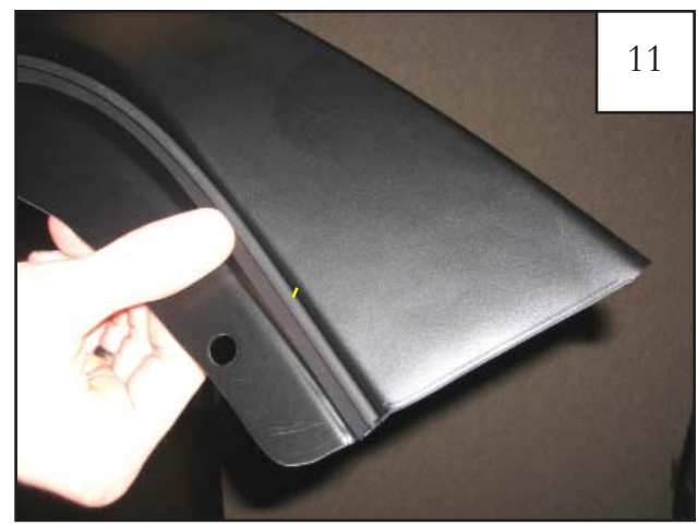
After gimp is properly placed, press to adhere properly and cut ends flush with ends of flare.