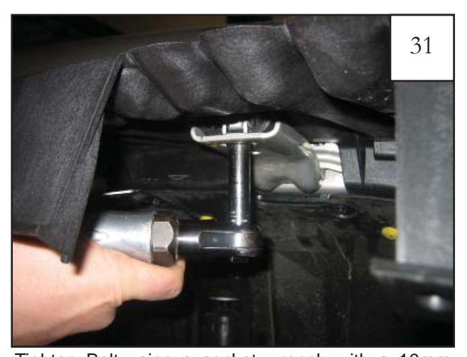
Tighten Bolt using a socket wrench with a 10mm socket.