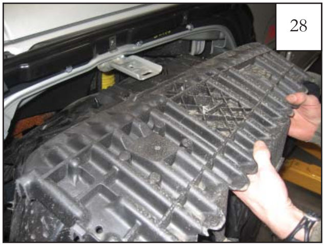
Replace factory inner structure/splash shield in fender as shown, sliding hole in structure over metal fender bracket.