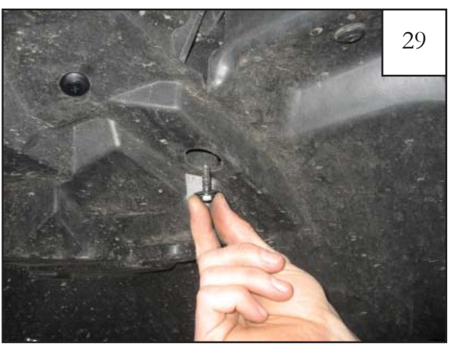
Reinstall the factory bolt through hole in splash sheild as shown.