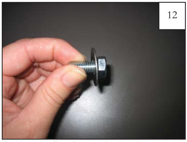
Position Inner Flare Piece on fender, aligning existing 5/16" holes in Inner Flare Piece with holes on fender. Slide a supplied 1" Fender Washer onto supplied Hex Head Bolt.