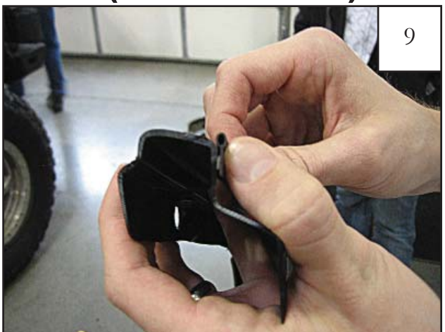
Make sure gimp and inner flare are clean. Peel 2" of liner from gimp (pin shape). Carefully position gimp as uniformly as possible along radius as shown, peeling liner as you go. Gimp can be repositioned as needed. Note: It is better for gimp to be slightly below the radius rather then above.