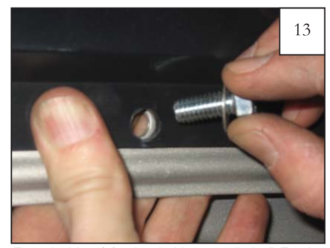
From inside of fender, hold a supplied 1" Fender Washer over hole. Insert a Bolt/Washer assembly through Inner Flare Piece, fender and washer on backside of fender.