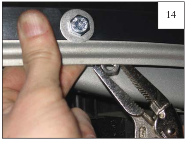
Using a vise grip, place a supplied Nylock Nut on the backside of the Bolt. Start bolts but do not tighten (8 places). Once all bolts have been started, tighten all bolts.