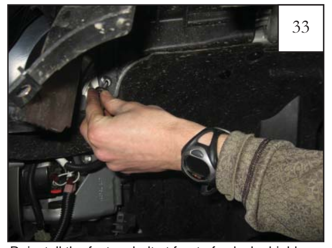
Reinstall the factory bolt at front of splash shield.