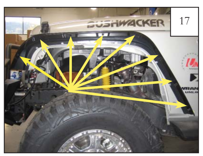
Threaded Clip locations.