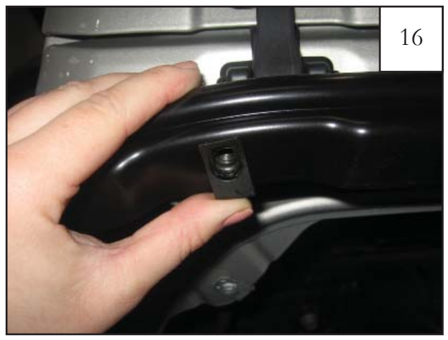
Install supplied "U" Nut, with the thread side in, over holes in Inner Flare Piece (8 places). Make sure nuts are centered over holes.