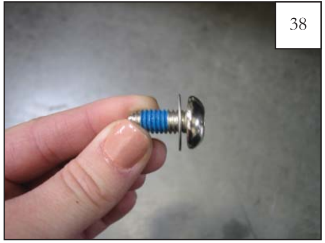
Slide a supplied .700" washer onto a supplied Torx Screw.