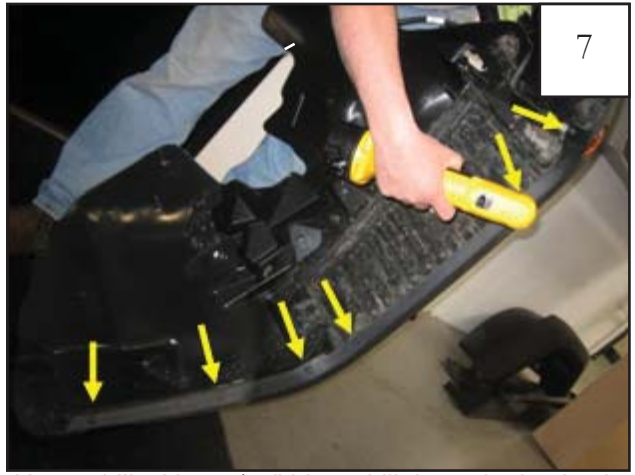
Use a drill with a 5/16" bit to drill through six plastic riviets along edge of flare/splash sheild. Discard the flare, but retian the splash shield and inner structure.