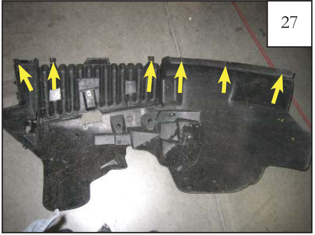
#14 U-Clip locations.