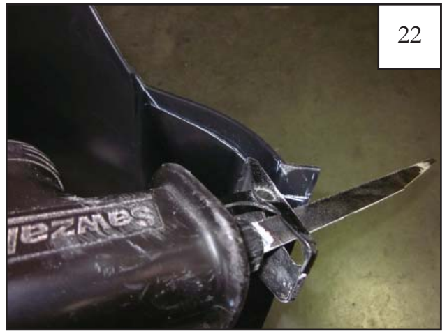
Using a sawsall, cut of section marked in step 21.