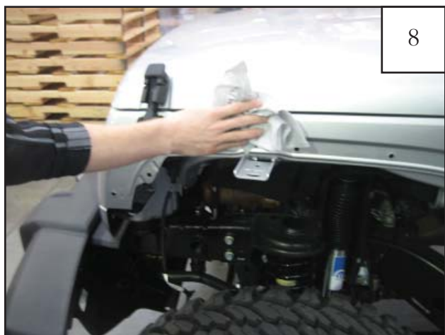
Clean fender area thoroughly with a soft clean cloth.