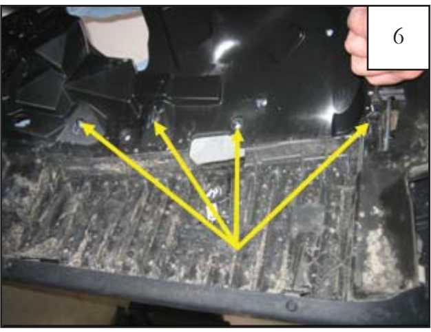
To remove inner structure and splash sheild from factory flare, use pry tool or flat head screwdriver to remove four plastic fasteners.