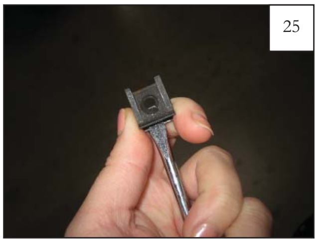
Use a flat head screwdriver to spread supplied #14 U-clips for ease fo installation.