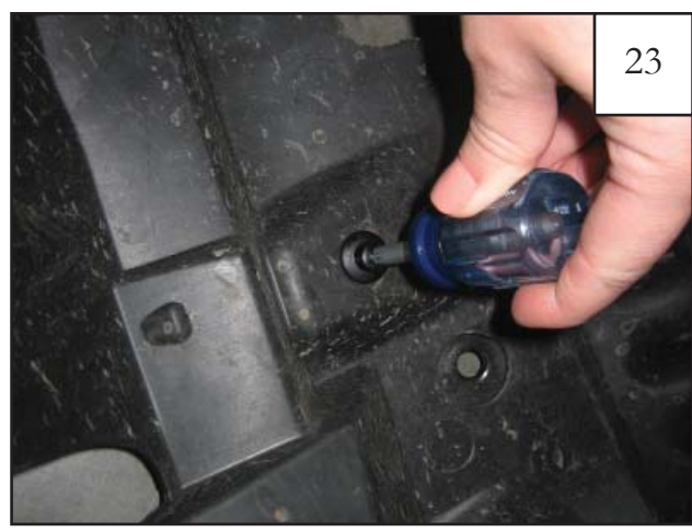
Using a Phillips screwdriver, reassemble inner structure and splash sheild by installing supplied Plastic Phillips Head Tufloks (6 places). Use a pushing-twisting motion to install.