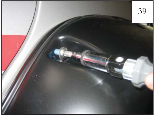
Start Screws/Washers through pocket holes in Outer Flare and into "U" Nuts installed in Step 17 (8 places). Do not tighten.