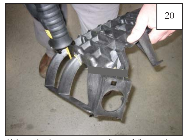
Using a hacksaw or a sawsall, carefully cut along lines made in Steps 19 and 20 to remove from portion of factory inner structure. Keep the rearward peice and set aside.