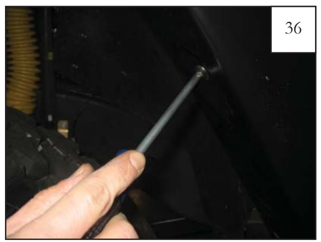
Install supplied Truss Head Screws through holes in wheel well and into #14 U-Clips installed in Step 26 (6 places). Ensure proper alignment of outer flare, inner flare and splash shield . Do not tighten at this time.