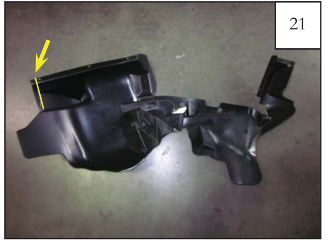
Using a grease pencil make a mark in 1" from edge of factory sheild and up to top edge of part where holes are located.