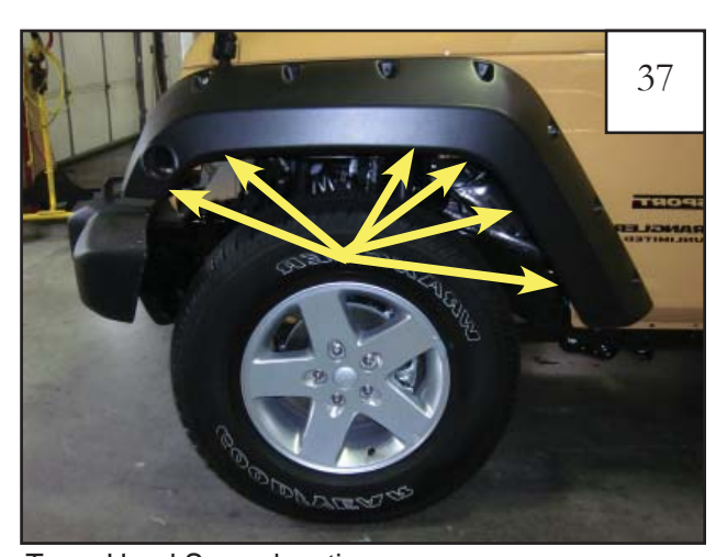
Truss Head Screw locations.