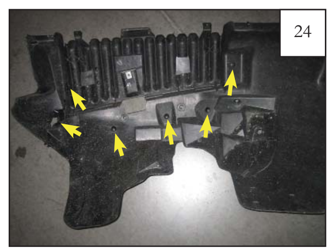
Plastic Phillips Head Tuf-Lok locations.