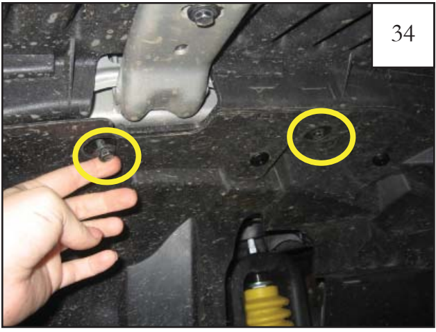
Reinstall two factory bolts as shown as well as reinstall marker light wiring.